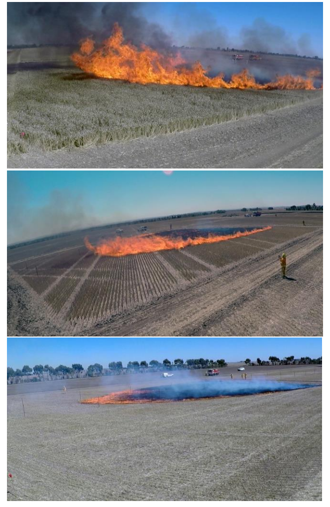
Figure 1. Comparison of flame structure of three experimental fires in different wheat crop conditions with similar prevailing weather; top: unharvested (GFDI 23.4), centre: harvested (GFDI 27.6) and bottom: harvested and baled (GFDI 26.7).

Danger Index (GFDI) of 14) and Severe (GFDI 71) with more than half of the fires conducted at ratings of Very High or greater grassland fire danger.